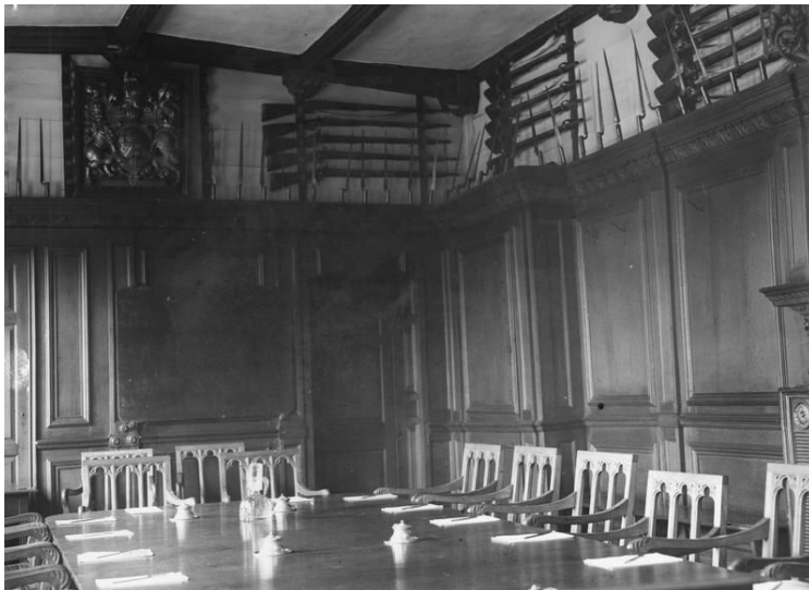
Committee Room 1 photograph from 1930's – from the Archives